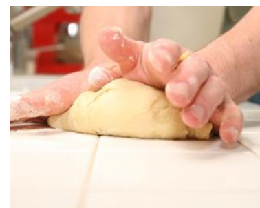
Kneading a bread dough