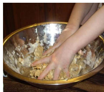
Rubbing in to mix fat and flour if making a yeast based product