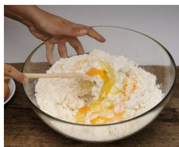
Mixing to combine ingredients if making savoury muffins or scones